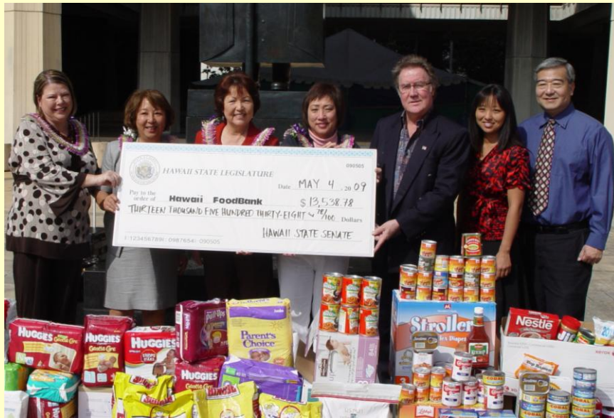
Senator Kidani with Senate President Colleen Hanabusa presenting check to the Hawaii Foodbank on behalf of the Senate. The Senate raised $13,538.78 during Session and 615 pounds of food.